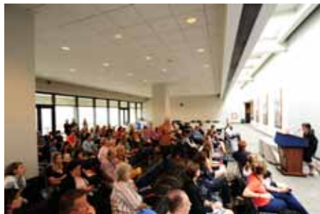
The congressional briefing.

Once again, in 2011, Meso Foundation advocates stormed Capitol Hill in conjunction with the Meso Foundation’s annual Symposium. 55 advocates met with 65 congressional offices.