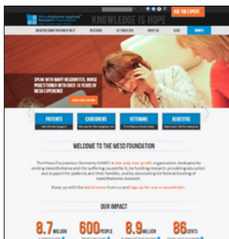
New website was launched in the summer of 2013.