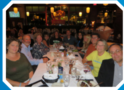
During Meso Awareness Day, hundreds of community members organized or participated in grassroots events raising awareness and funding. Above are some community members who attended the Rockefeller Plaza Today show event, the New York conference, and the dinner that followed.