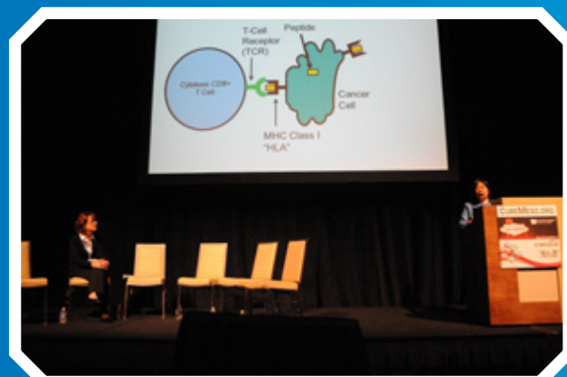
The Symposium continued to be the only event of its kind, where scientific information is shared directly from researchers and physicians and delivered to patients and their families. The Foundation understands the importance of this information in the hands of patients, so most Symposium presentations are recorded, live broadcast during the event, and then posted on the Foundation's website.