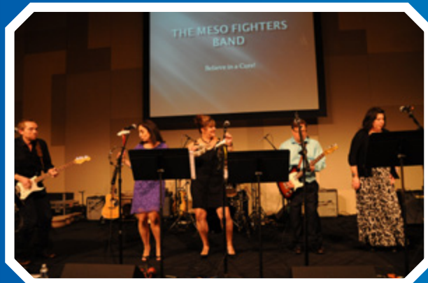
The Meso Fighters Band (consisting of community members), instituted officially for the first time at the Las Vegas Symposium, is now a staple during the entertainment portions of the Symposium.