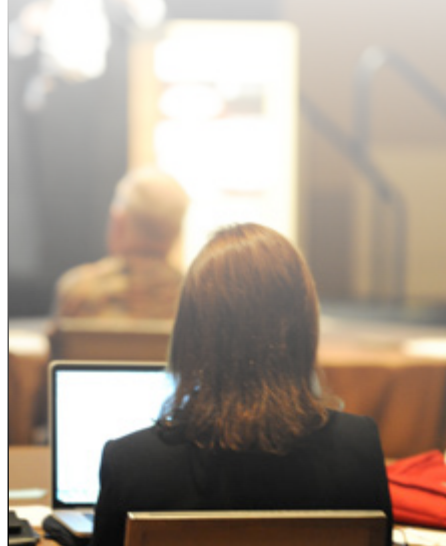
The 2013 International Symposium on Malignant Mesothelioma was held in Las Vegas, NV.