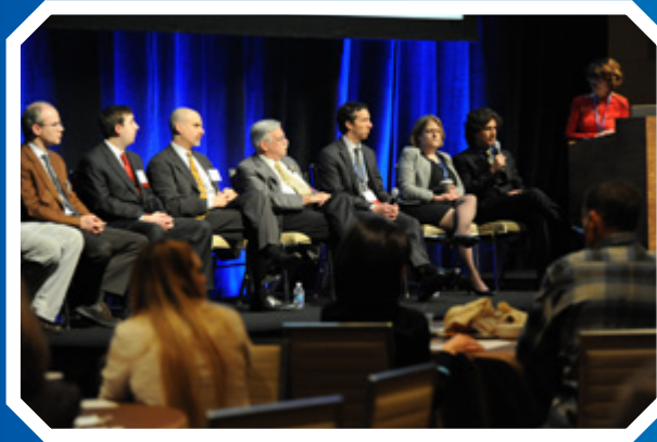
The 2013 International Symposium on Malignant Mesothelioma took place in Las Vegas, Nevada, bringing together top experts in the field of mesothelioma, with patients, their families, caregivers and the bereaved community.