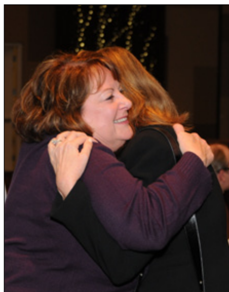
In 2013, patients, caregivers, and bereaved were encouraged to participate in Foundation-led support groups (in person, online, and over the phone).