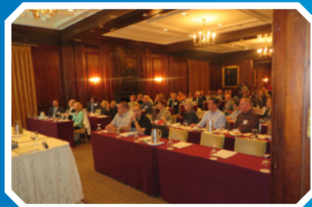
The 2013 regional conference was in its second year, and took place in New York, NY.